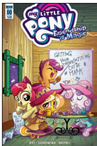
COVER A art by Agnes Garbowska