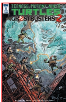
Cover B Art by Dave Wachter