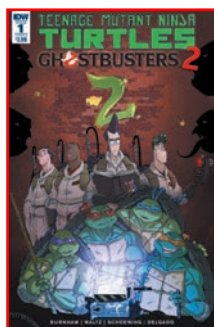
Cover A Art by Dan Schoening