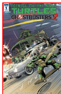
Cover RI Art by Karl Moline