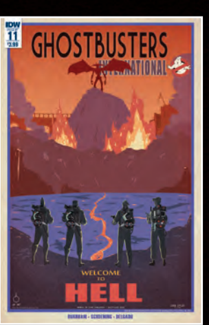
REGULAR COVER ART BY DAN SCHOENING