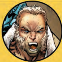
OLD MAN LOGAN