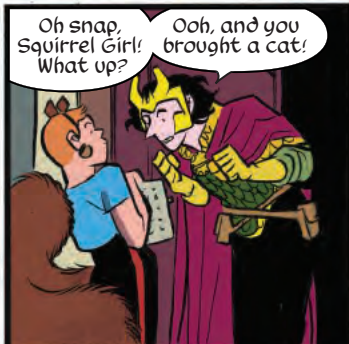
Those reviews go on for pages, by the way. It's just--it's pages and pages of people dunking on Doctor Strange's house and its parking situation. Nobody tell Strange, it'll really hurt his Feelings.