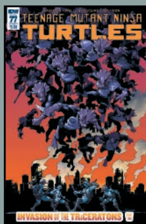
Cover A Art by Damian Couceiro