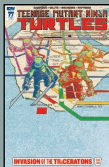
Retailer Incentive Cover Art by Valentine De Landro