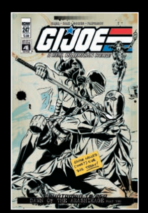
Cover B Artist's Edition Art by SL Gallant