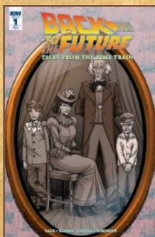
Incentive Cover A Art by Alan Robinson Colors by Charlie Kirchoff