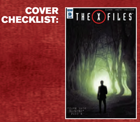
REGULAR COVER Art by Menton<sup>3</sup>