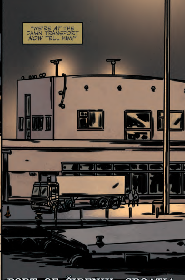
PORT OF ŠIBENIK, CROATIA TEN HOURS PRIOR