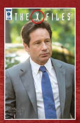
SUBSCRIPTION COVER Photo Cover