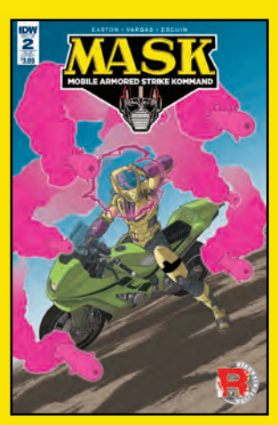
SUBSCRIPTION COVER Art by Joe Suitor