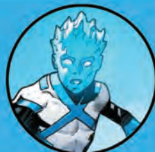
ICEMAN BOBBY DRAKE