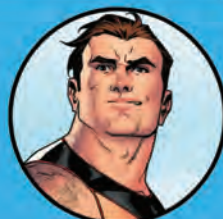
BEAST HANK MCCOY