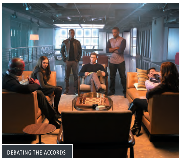
DEBATING THE ACCORDS