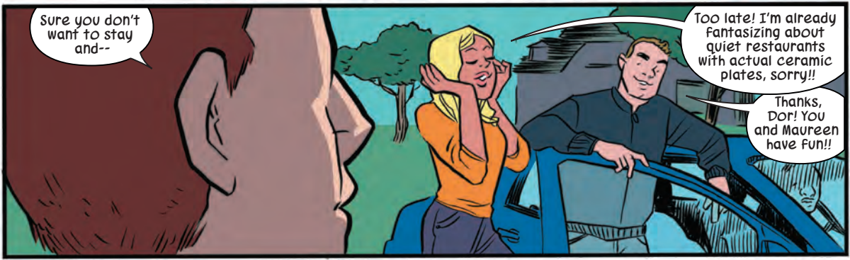
Where are the crossover restaurants that give you both the classy ambiance and the charmingly snooty maitre d', but also the crayons and the paper tablecloth you can draw on? "No idea," you whisper, as we both smuggle our crayons and coloring books past the charmingly snooty maitre d'.