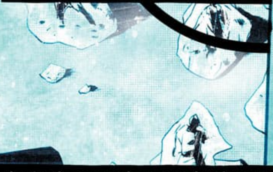
He checks the researchers, but the blast was too sudden, caused the water in their cells to expand, bursting vessels and capillaries.