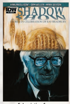
Subscription Cover Art by Shane Pierce