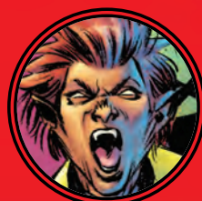
WOLFSBANE RAHNE SINCLAIR