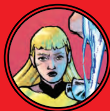
MAGIK ILLYANA RASPUTIN