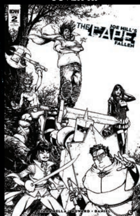
ART ZACH HOWARD