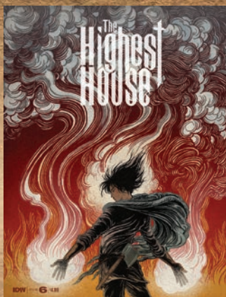
Regular Cover by Yuko Shimizu