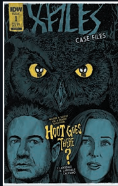
B COVER ART BY J.J. LENDL