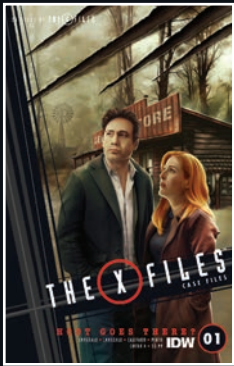
A COVER ART BY CATHERINE NODET