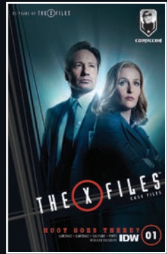
MONTREAL COMIC CON EXCLUSIVE PHOTO COVER