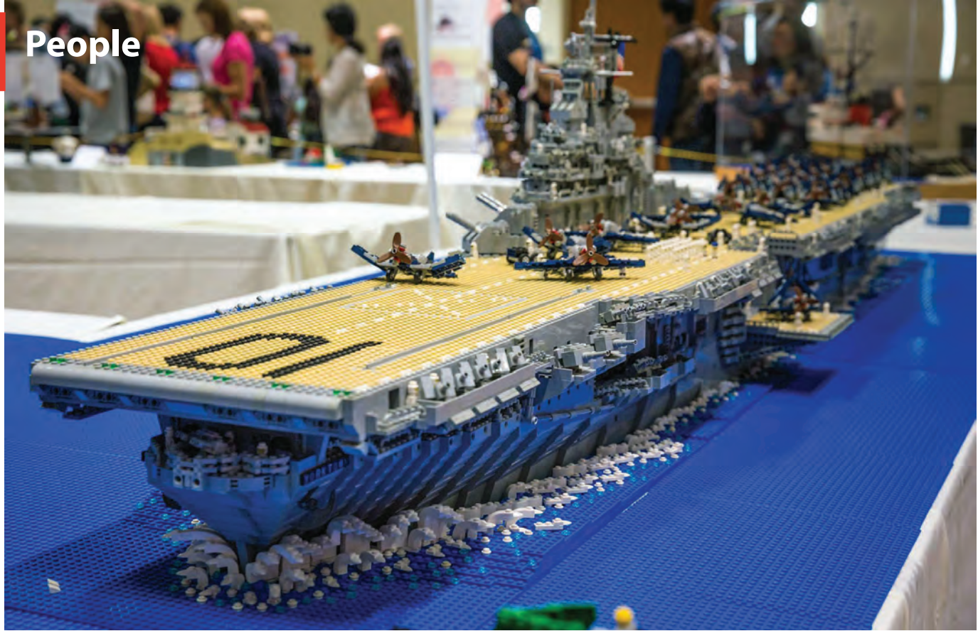
The USS Yorktown.