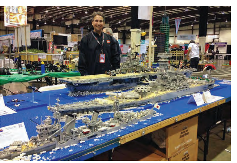
Marcello with his ships, from front to rear: The destroyer Yukikaze, the super battleship Yamato, and aircraft carrier Yorktown.

All the LEGO ships and planes are built to the same scale (1:108) from actual blueprints and diagrams. Here are some measurements and details: