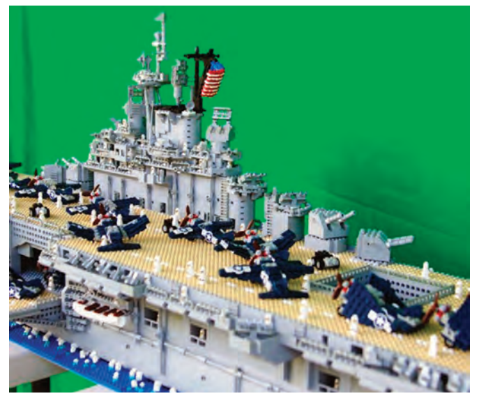
Some details on the Yorktown.