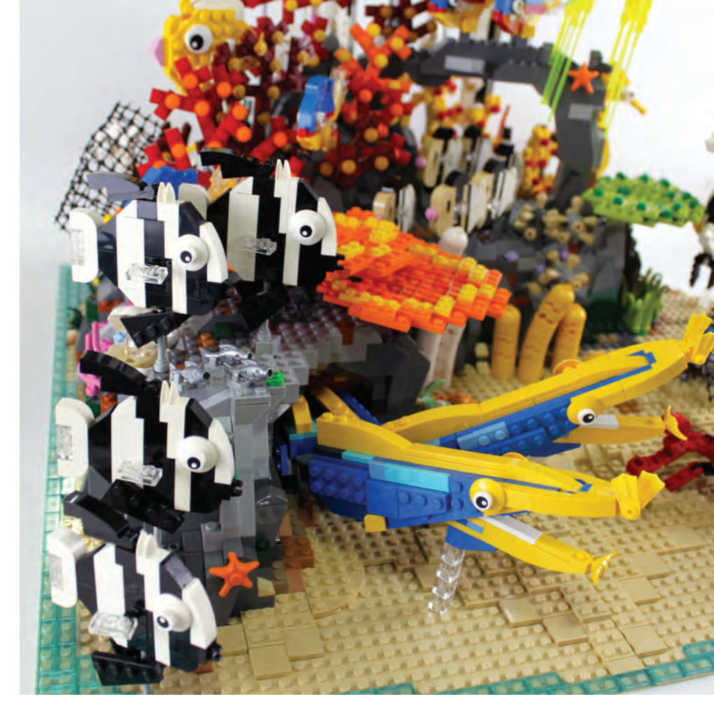
Some views of the reef, showing the fish, the blue ribbon eels, and a crab.

I did not have LEGO sets when I was young, so I bought a lot of sets in 2007, such as Vikings and Castle series. I bought almost all of them (I needed all kinds of parts), and I started building my own creations. I have always been building since 2007 to the present. My favorite themes are Pirates and ocean adventurebased, because pirates and marine explorers are free to sail and explore.