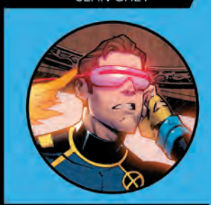
CYCLOPS SCOTT SUMMERS