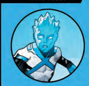
ICEMAN BOBBY DRAKE