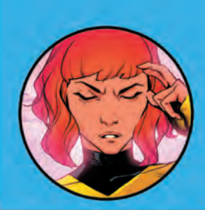
MARVEL GIRL JEAN GREY