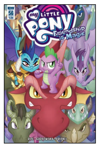
COVER A art by Agnes Garbowska