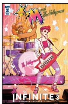
COVER B ART BY VERONICA FISH