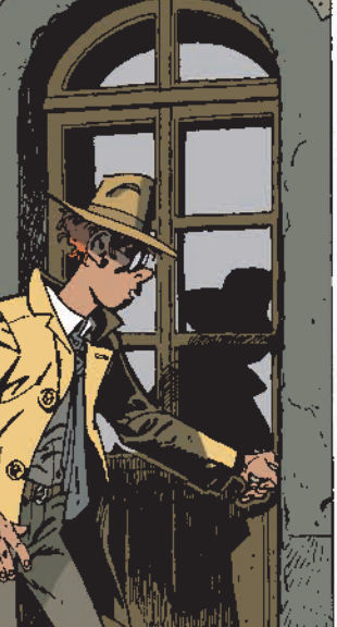
... THE MUNDANE CONCERNS OF EVERYDAY LIFE!