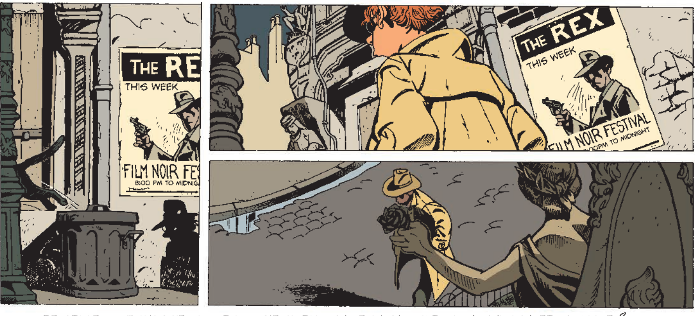
... REGARDLESS OF WHAT WE SAY OR DO, THE WORLD CAN BE AN UNCOMPROMISING AND DANGEROUS PLACE