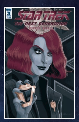
SUBSCRIPTION COVER Art by George Caltsoudas