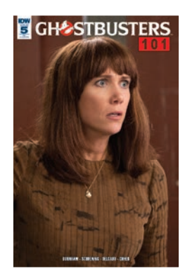
RETAILER INCENTIVE WRAPAROUND PHOTO COVER