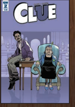
COVER B ART BY NELSON DANIEL