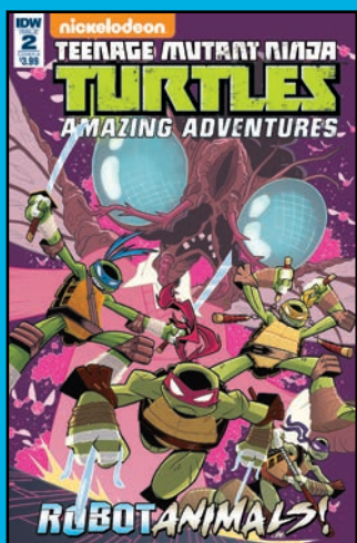
COVER A