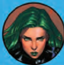
POLARIS LORNA DANE