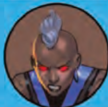
BLOODSTORM ORORO MUNROE