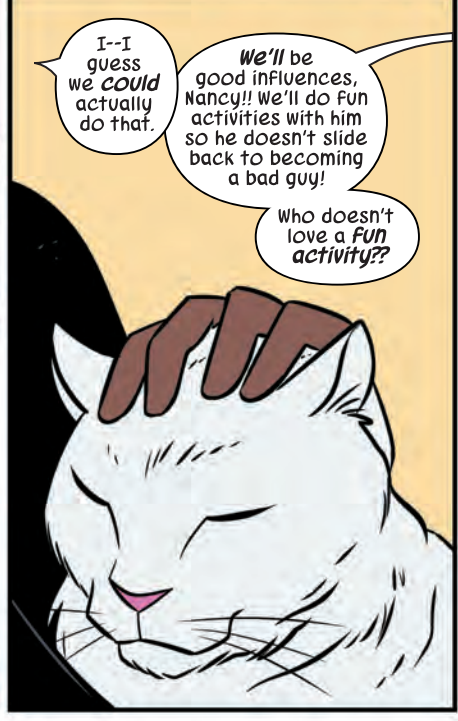
Tell me you wouldn't read a book called "Stone-Cold Kickin' It With Sergei Kravinoff." If you did, bad news: you just told a big ol' lie.