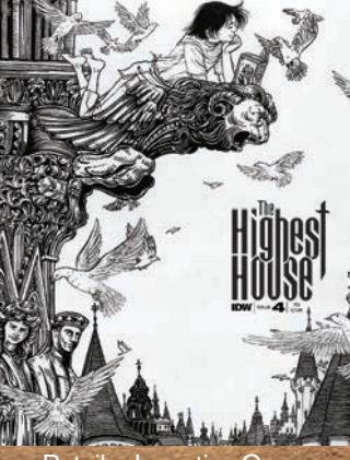
Retailer Incentive Cover by Yuko Shimizu