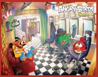
ARTWORK BY PHILIP MURPHY