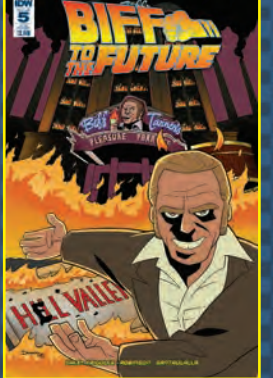
SUBSCRIPTION COVER ART BY DEREK FRIDOLFS COLORS BY PAMELA LOVAS