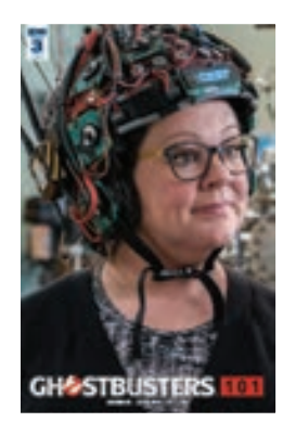
RETAILER INCENTIVE WRAPAROUND PHOTO COVER