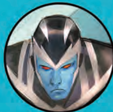
ARCHANGEL WARREN WORTHINGTON III