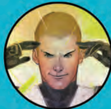
X CHARLES XAVIER