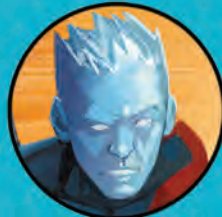
ICEMAN BOBBY DRAKE