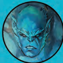
BEAST HANK MCCOY