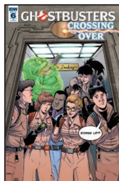
RETAILER INCENTIVE COVER