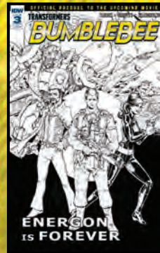
RETAILER INCENTIVE COVER