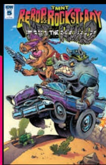
Cover RI Art by Aaron Conley