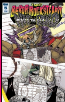
Cover B Art by Ben Bates