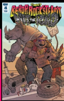
Cover B Art by Kyle Strahm