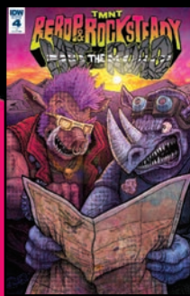
Cover RI Art by Buster Moody