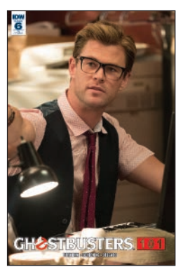
RETAILER INCENTIVE WRAPAROUND PHOTO COVER