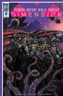
Incentive Cover Art by Kevin Eastman Colors by Tomi Varga