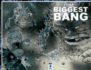
SUBSCRIPTION COVER BY VASSILIS GOGTZILAS

For international rights, contact licensing@idwpublishing.com