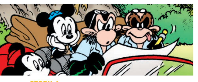
STORY 4 Reform and Void from Mickey Mouse daily comic strip (1994)