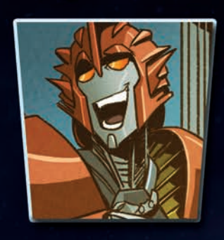
KNOCK DUT Velocitronian Ambassador