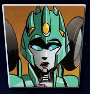
MOONRACER Velocitronian Ambassador