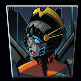
WINDBLADE Camien Delegate