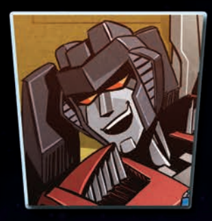
STARSCREAM Ruler of Cybertron