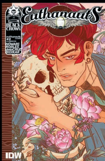
Cover B by Cara McGee