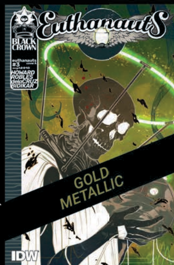
Cover RI by Nick Robles