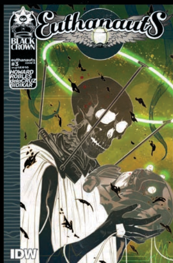
Cover A by Nick Robles