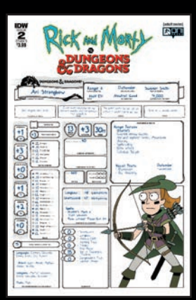
B Cover Art by Troy Little