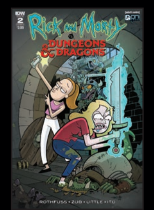
A Cover Art by Troy Little