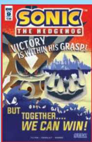
COVER B ART BY TRACY YARDLEY