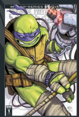
Double Midnight Art by Ben Bishop