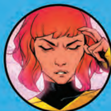
MARVEL GIRL JEAN GREY