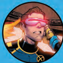
CYCLOPS SCOTT SUMMERS