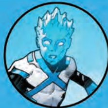
ICEMAN BOBBY DRAKE