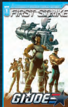
RETAILER INCENTIVE COVER